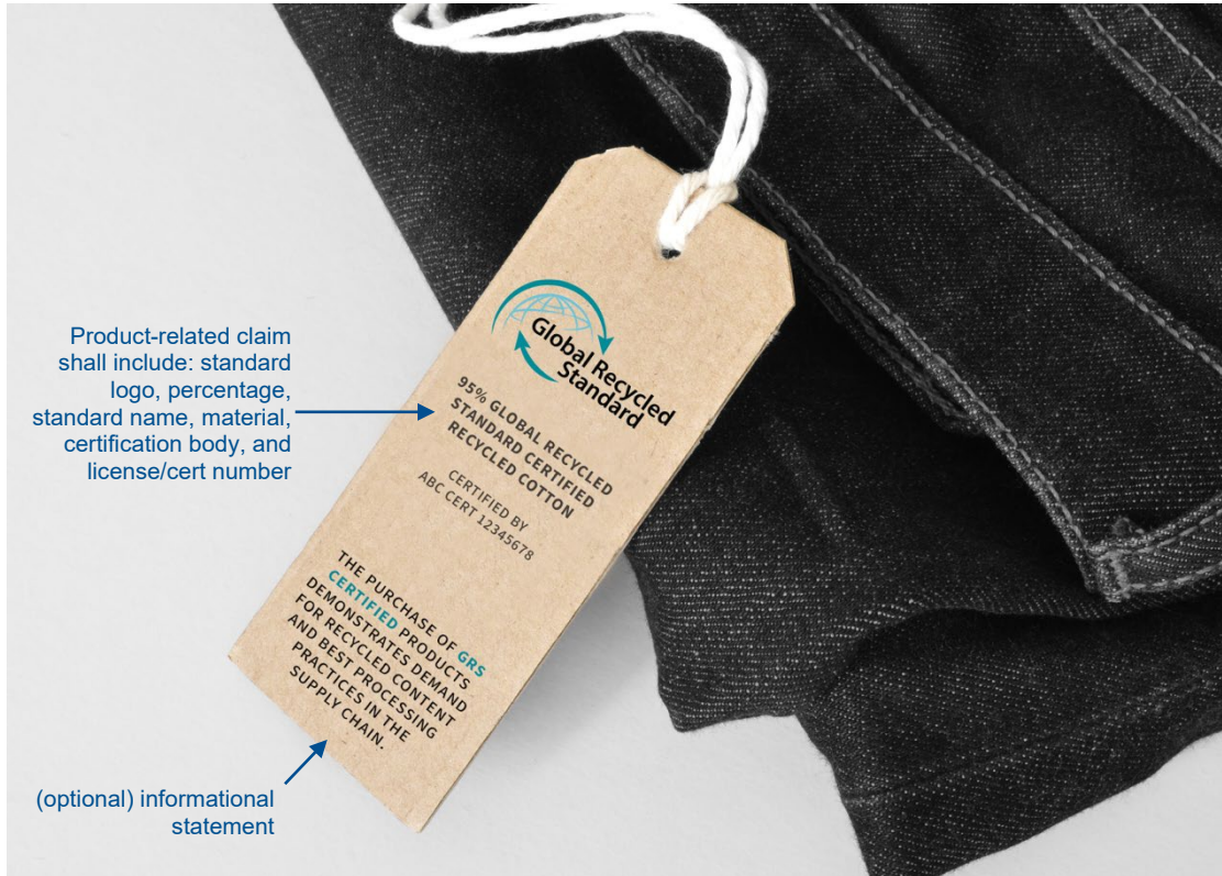
Product-related claim (on-product): GRS