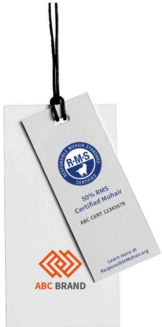
Product-related claim (on-product): RMS