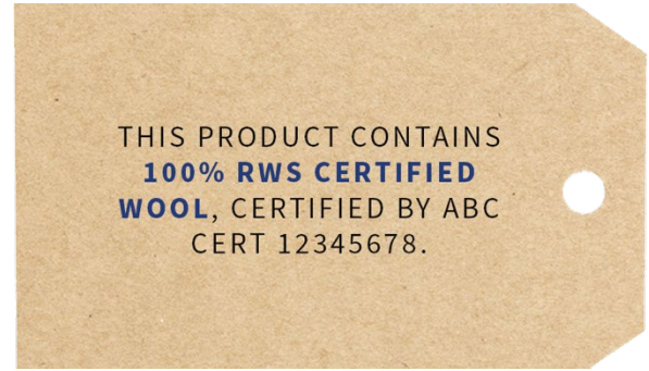
Product-related claim (on-product): RWS